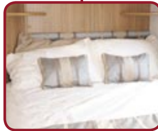
The bedroom feels well separated from the living area