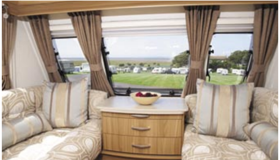
Upholstery of great style in light-reflecting fabrics creates a splendid lounge