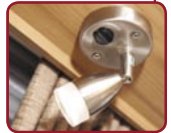
Spotlights: every caravan has them but these are simpler than most