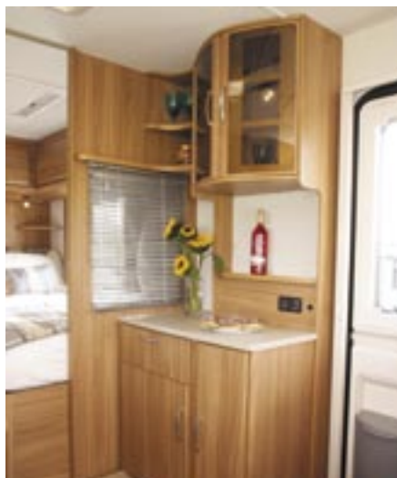
This cabinet provides extra kitchen surface