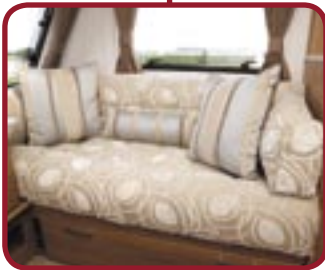
Six cushions ensure lounge comfort that's simply sumptuous