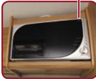
Even the microwave oven is stylish, with black and silver-effect door