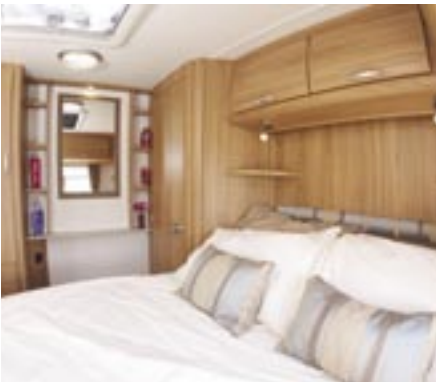
The bed cushions and cover are by Jonic Bedding