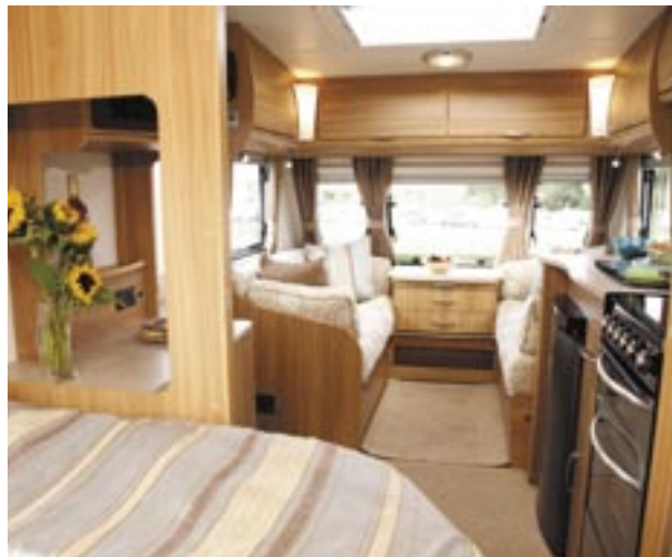
The SE looks and feels a luxury caravan from every angle