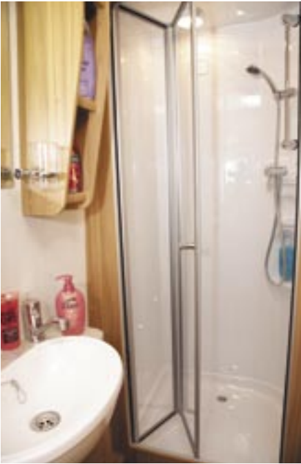
All you need is here in an end washroom