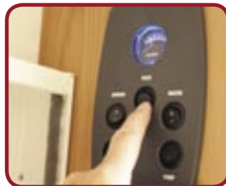
Blue-lit volts and water gauge looks cool as well as being easily readable