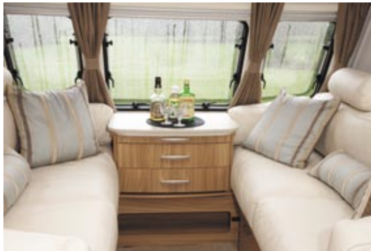
Pale surfaces match the upholstery and help to create a light, bright environment