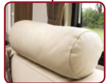
Neck-height bolsters provide added comfort in the lounge