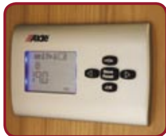
Alde heating - programmable 24-7 - gives home-from-home luxury