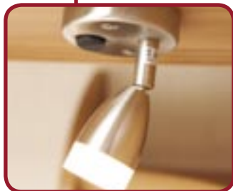
Cone-shaped spotlights with glass and metal shades - very pretty