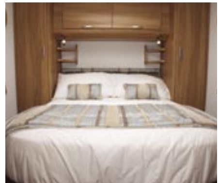
An utterly gorgeous bedroom