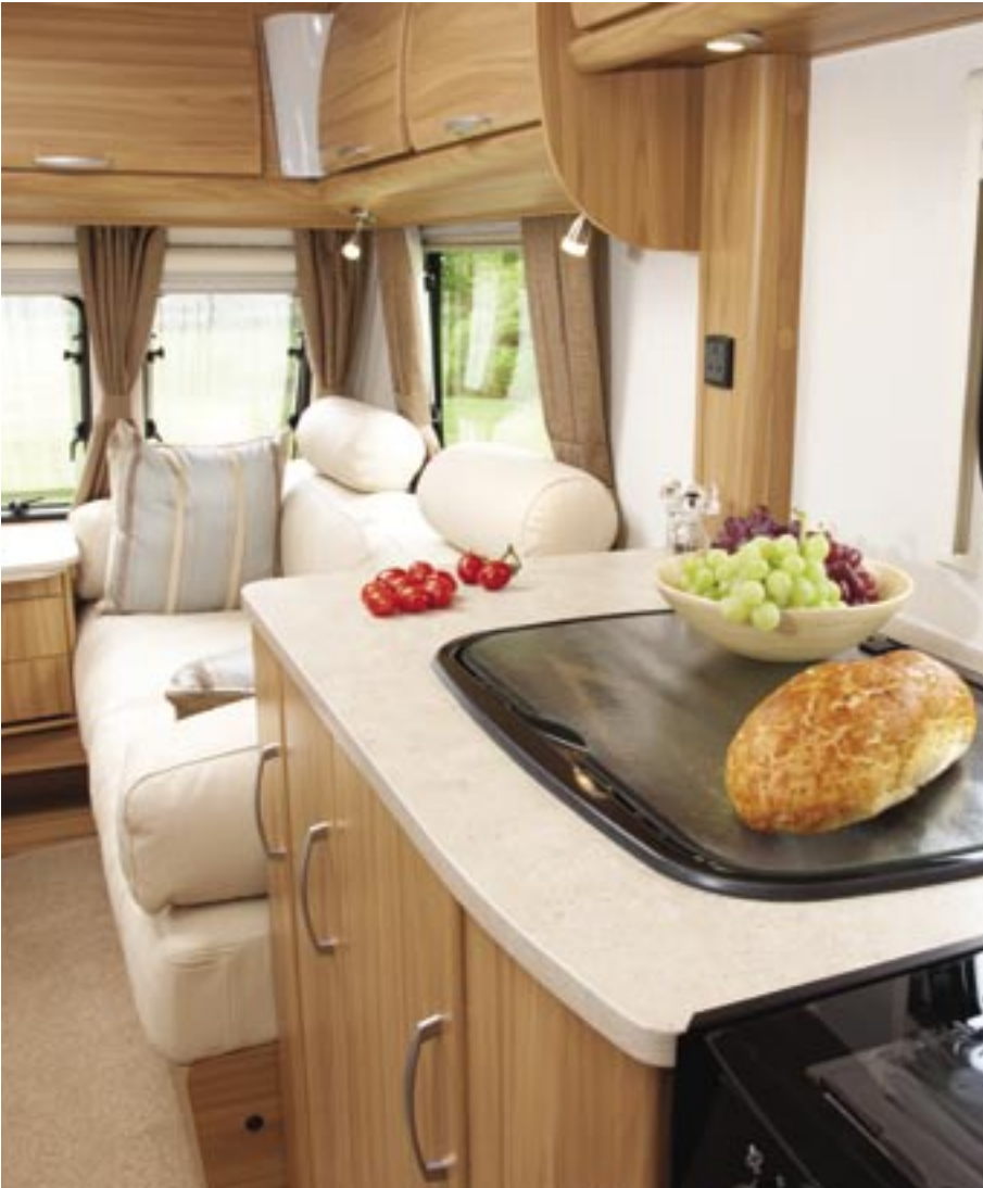
Good cupboard space in the kitchen but surface space is limited

The microwave, above the freezer, is a Daewoo model with cooking time facility – you choose from its menu of meat, poultry, fish, for auto-defrost function and it works out the time for you. Then chose fresh or frozen vegetables, jacket potatoes or soup and it will work out the cooking times. It's a nice touch that adds to the luxury level of this caravan – but you have to be a microwave-orientated cook to appreciate it. Me? I'm far more a fan of that electric hotplate and three good-sized burners plus the gas oven.