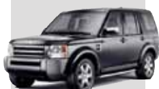
LAND ROVER 2230KG