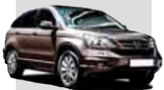
HONDA CRV 1890KG