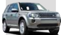
FREELANDER 2 1785KG