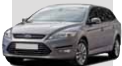
MONDEO ESTATE 1654KG