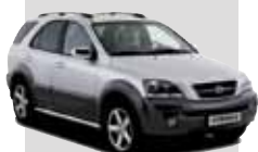
KIA SORENTO 2067KG