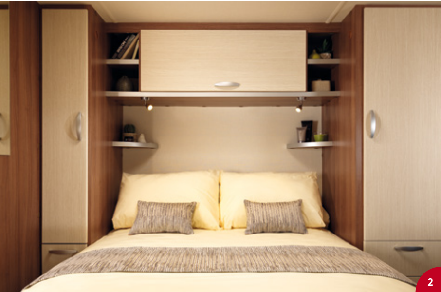
2 | Venus 570/4 - 4 berth with transverse island bed