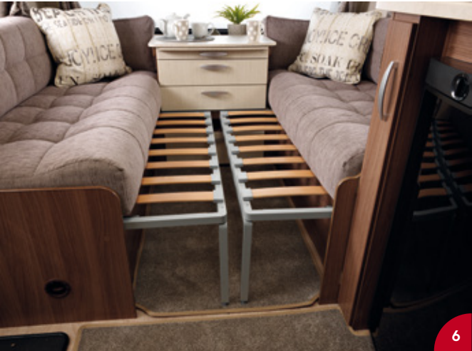
6 | 'Easy Action' slide-out bed bases