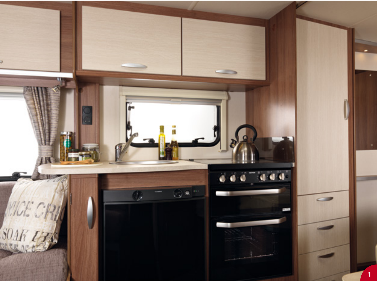
1 | New Thetford K Series Oven with four burner hob