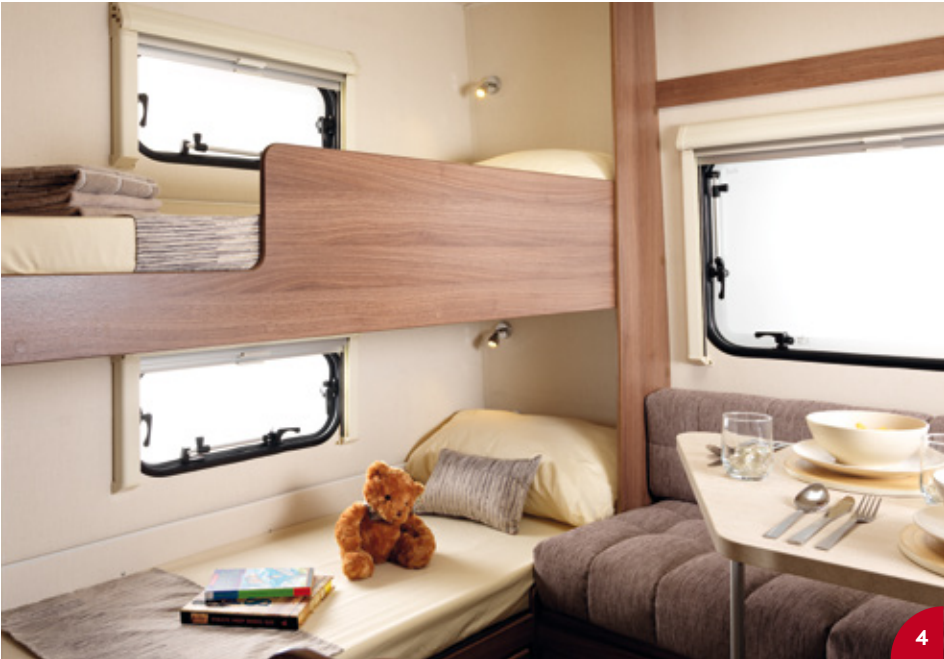
4 | Venus 590/6 - 6 berth with fixed double bunks and rear dinette