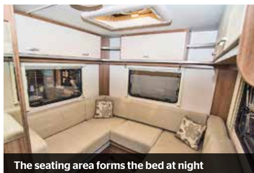
The seating area forms the bed at night