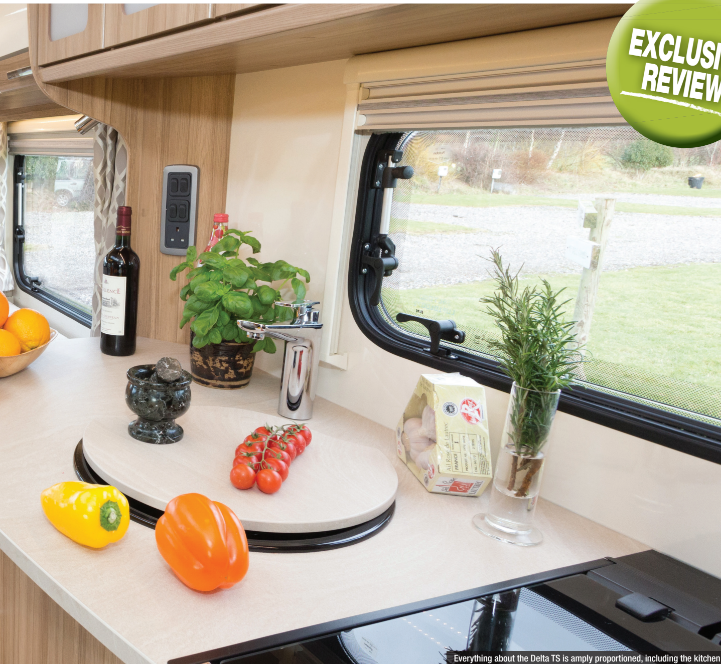
Everything about the Delta TS is amply proportioned, including the kitchen