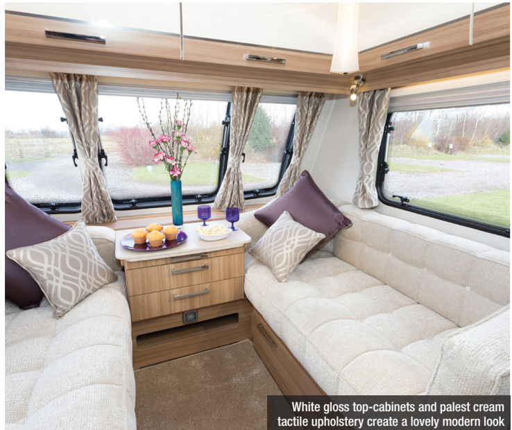
White gloss top-cabinets and palest cream tactile upholstery create a lovely modern look

the exceptionally light, bright look. The forward armrests give really good back and shoulder support. Comfort, we discovered during our TS test, is a given!