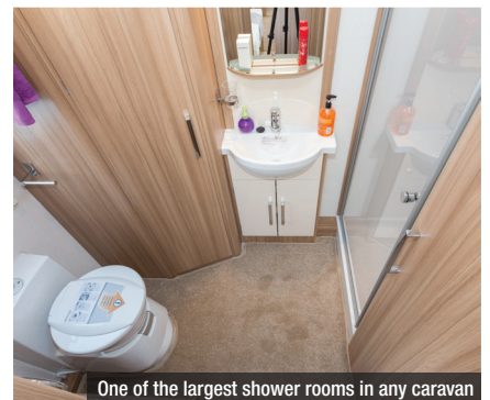
One of the largest shower rooms in any caravan