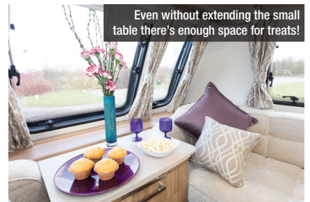
Even without extending the small table there's enough space for treats!