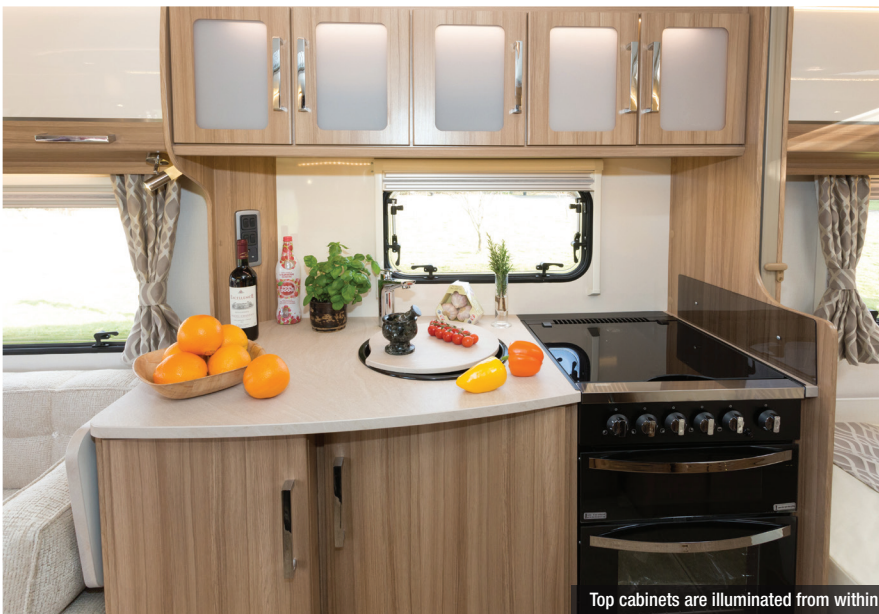
Top cabinets are illuminated from within