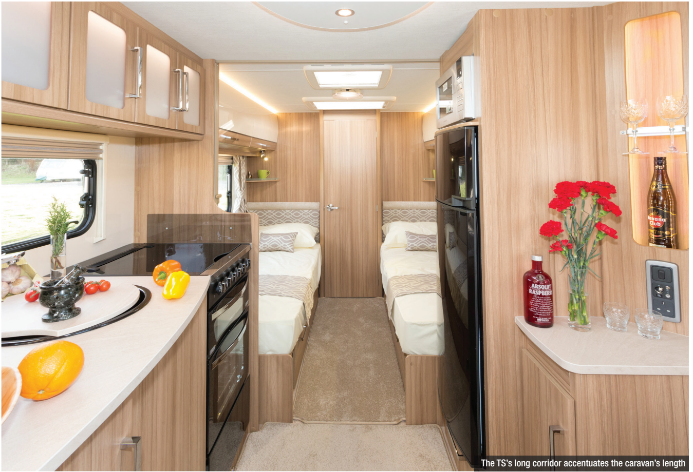
The TS's long corridor accentuates the caravan's length