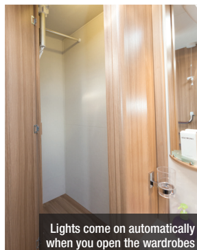
Lights come on automatically when you open the wardrobes