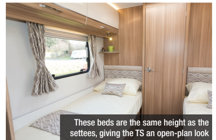
These beds are the same height as the settees, giving the TS an open-plan look