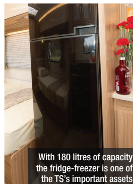
With 180 litres of capacity the fridge-freezer is one of the TS's important assets