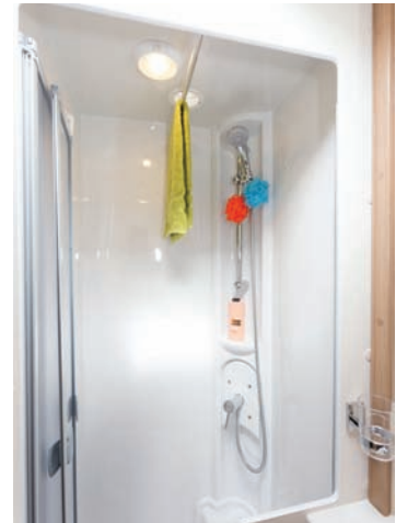
Importantly, a towel rail runs across the ceiling of the shower