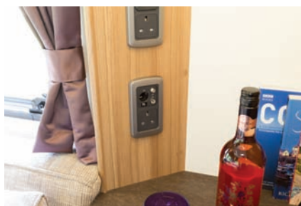
This is one of three sets of connection points, each with 12-volt sockets as well as mains power

Cool mauves, shiny purples and weave-pattern upholstery create a modern feel. Corner lights integrate smoothly with the top-locker styling. Cylindrical brushed steel spotlights focus light down nicely from each of the four corners.