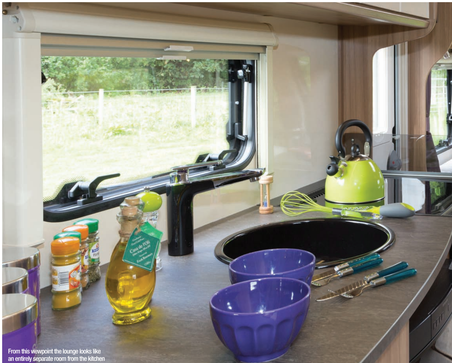
From this viewpoint the lounge looks like an entirely separate room from the kitchen