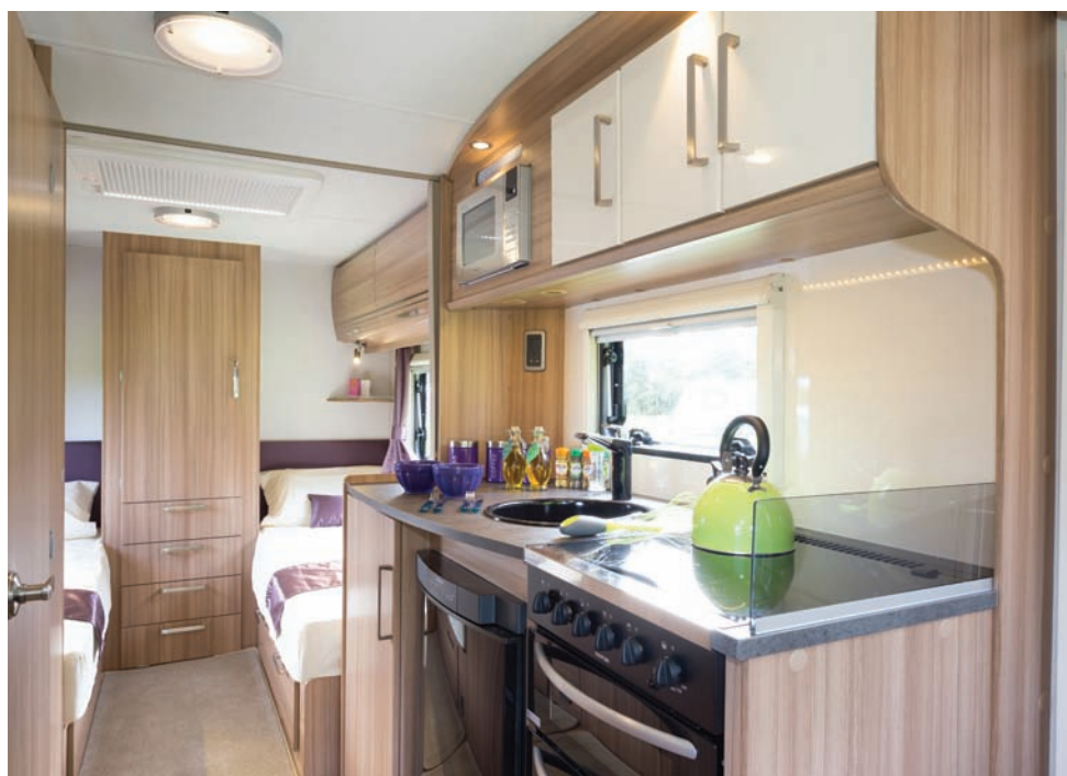
It's a central-corridor kitchen but there is plenty of space here