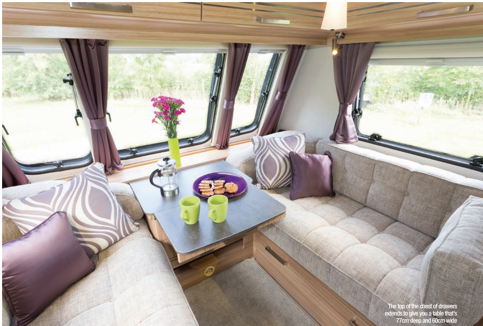
The top of the chest of drawers extends to give you a table that's 77cm deep and 60cm wide