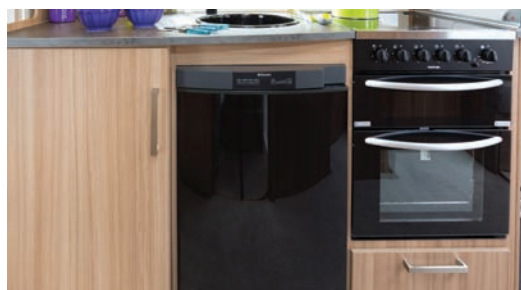
The cabinet alongside the fridge is a generous width and depth, with a shelf 45cm from the base, allowing for tall cereal boxes