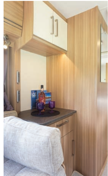
The dresser gives you the ideal place for your television... or booze