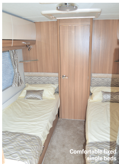
Comfortable fixed single beds

Both super-comfy beds are identically sized, offering a luxurious 2ft 7in width. At 6ft 2in, they're not the longest, though – if you're anywhere near that height >>