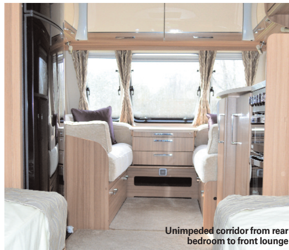
Unimpeded corridor from rear bedroom to front lounge

"...there's an impressive sensation of space in all areas, most noticeably around the kitchen"