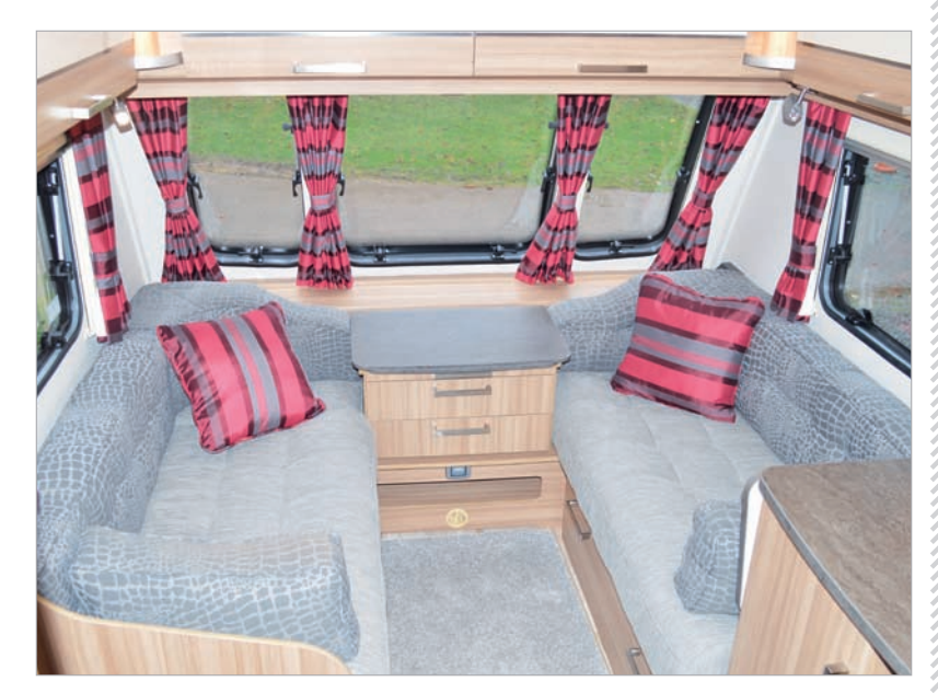
The front lounge is short - but very sweet