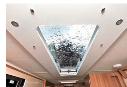
The wider rooflight has LEDs in its surround