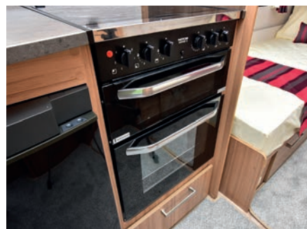
The kitchen looks smart and is well fitted-out

The lounge will seat four, and the alarm sensor and tilt sensor are placed in the centre chest's base. The drawers in that central chest add to the storage, and an occasional table extends from the top. For entertainment,