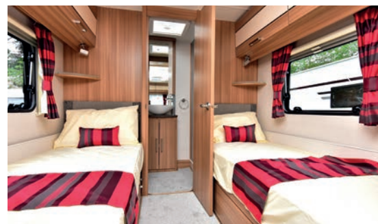
Each twin bed gets a reading light, shelf and large window