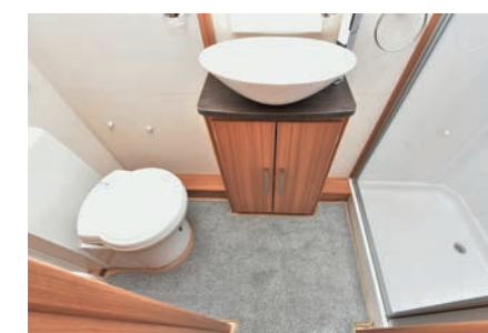
The spacious washroom offers good storage

you get a radio/CD player whose speakers are located below the front roof lockers.