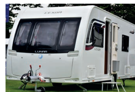
Well-specified, but there's no exterior gas point