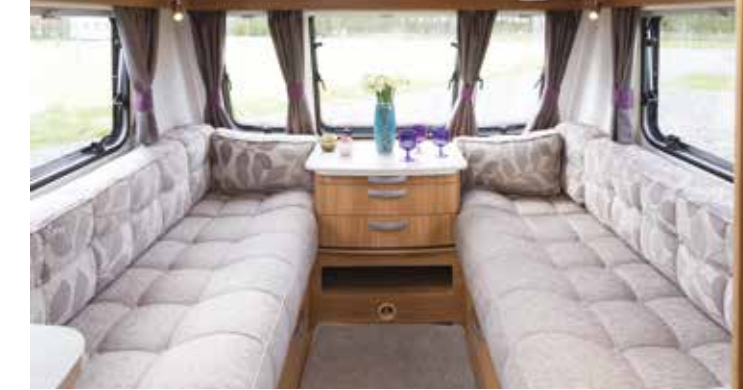
The front lounge is long enough to make single beds