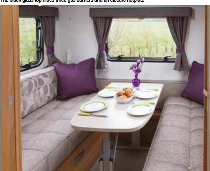
The rear dining-lounge area is a delightful separate room

the rear end and one for the lounge. Connections are on the offside corner of the front window area, ideally placed so that you can put your television on the windowsill; at 17m it's deep enough, so the TV doesn't have to take up space on the top of the chest of drawers.