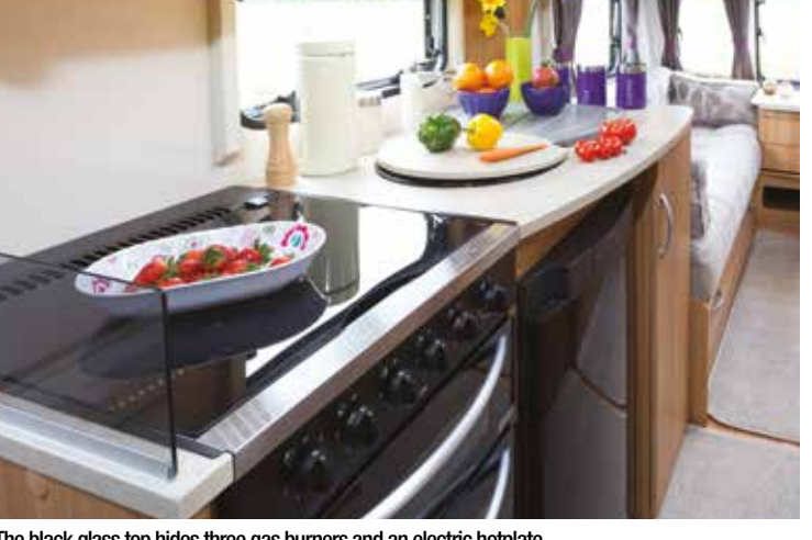
The black glass top hides three gas burners and an electric hotplate

You can bring two televisions on holiday in a 525 if you wish, one for