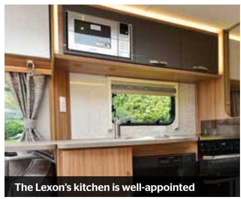
The Lexon's kitchen is well-appointed

Step inside the 570 and this single-axle model offers the usual spacious ambience of a Lunar tourer. The lounge has plenty of natural light flooding in the large side and front windows and sunroof. There is also Lunar's Maxi roof skylight with its LED integral lighting, complementing the LED corner spots and overhead locker lighting. There's a central chest of drawers, seat base access flaps, alarm sensor and an easy-to-make up double bed with pull-out frame. Seat comfort is excellent and I liked the extra front lockers either side of the sunroof. The lounge