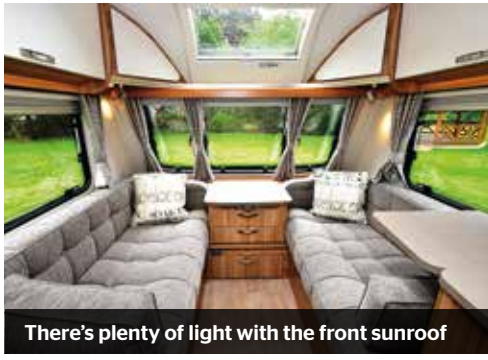
There's plenty of light with the front sunroof

However, with new graphics, a refreshed front panel and satin-styled grab handles this Lexon looks good. Its interior has also had a few alterations, making it very agreeable.